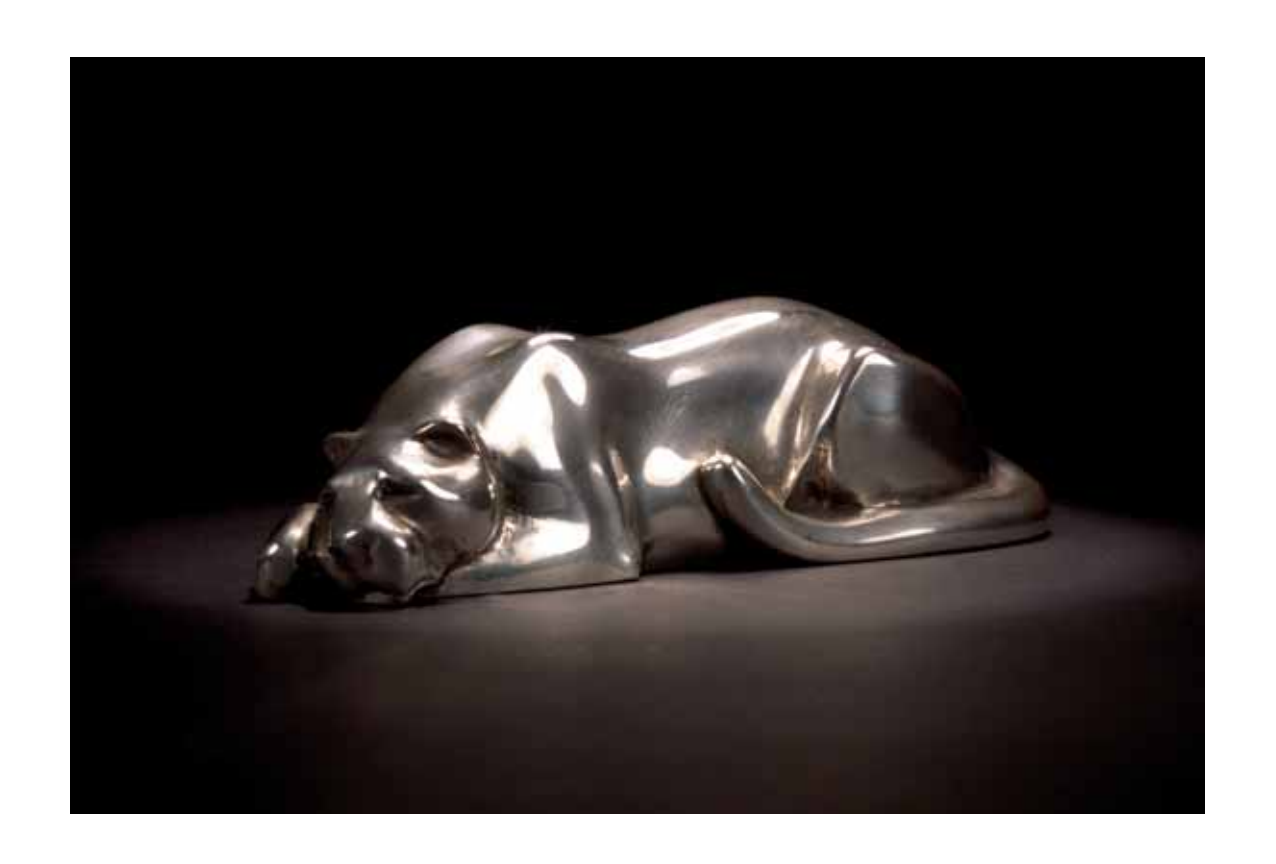
Jaguar Sterling Silver Edition of 9 4cm high