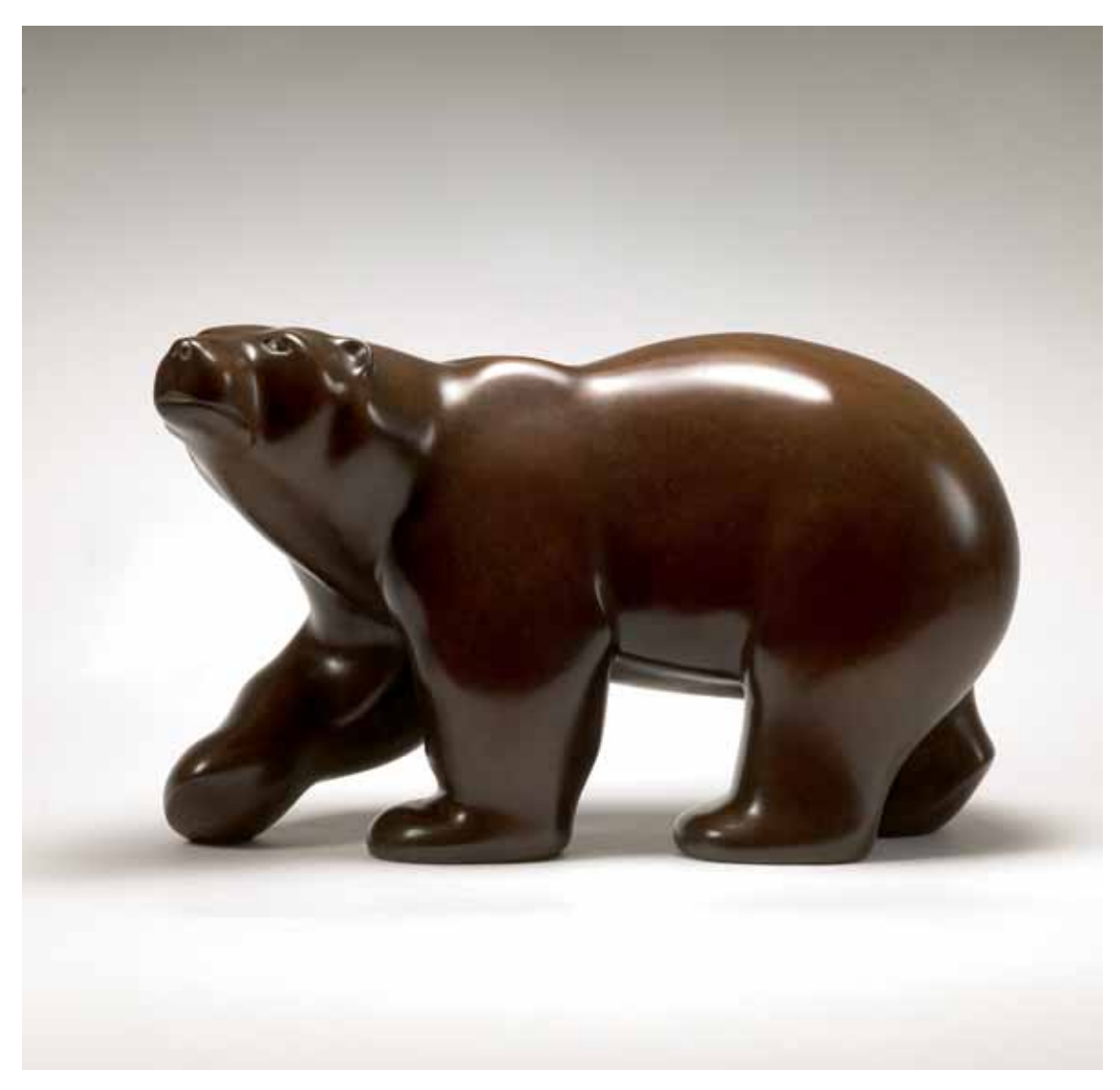
Grizzly Bear Bronze Edition of 9 30cm high