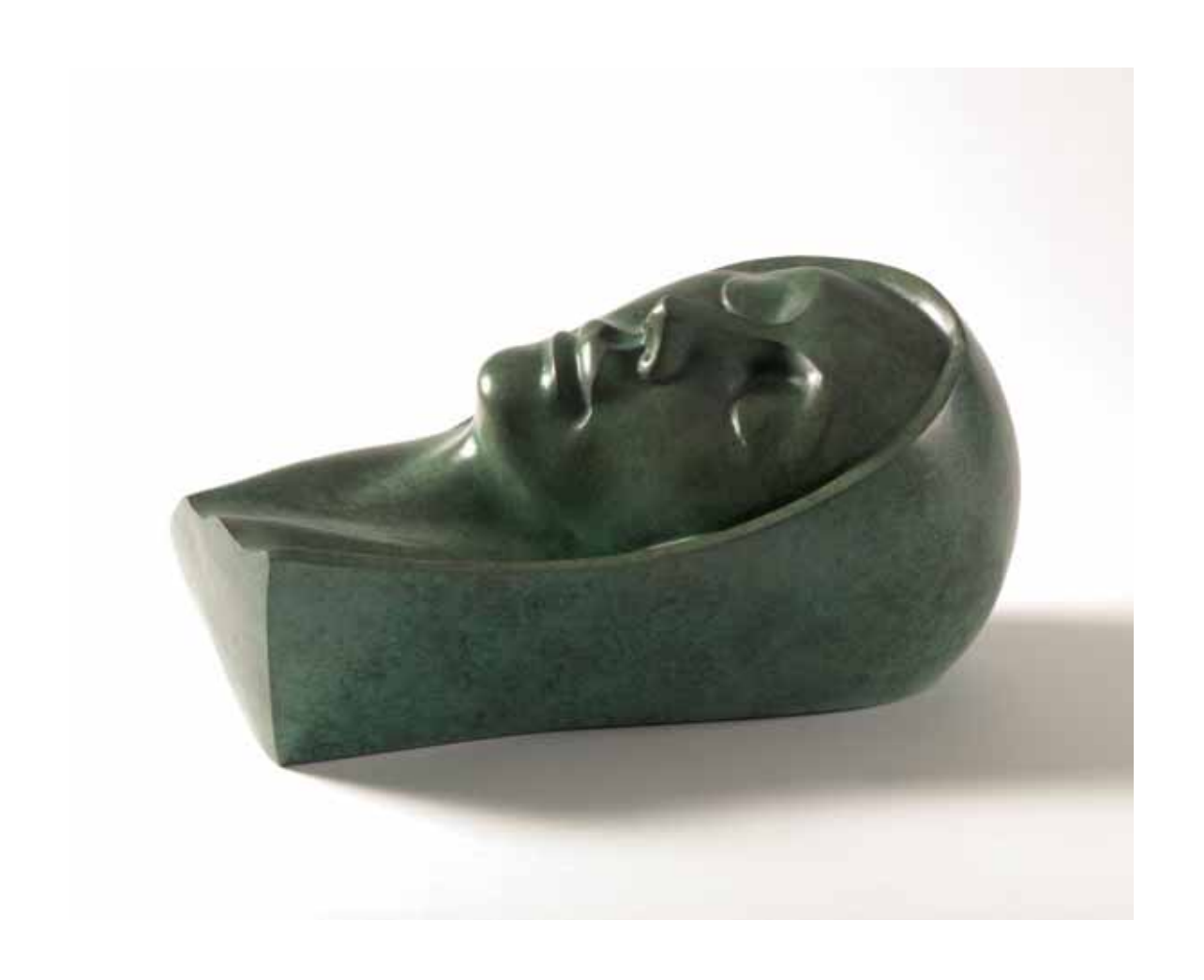
Reclining Head Bronze Edition of 9 14cm high