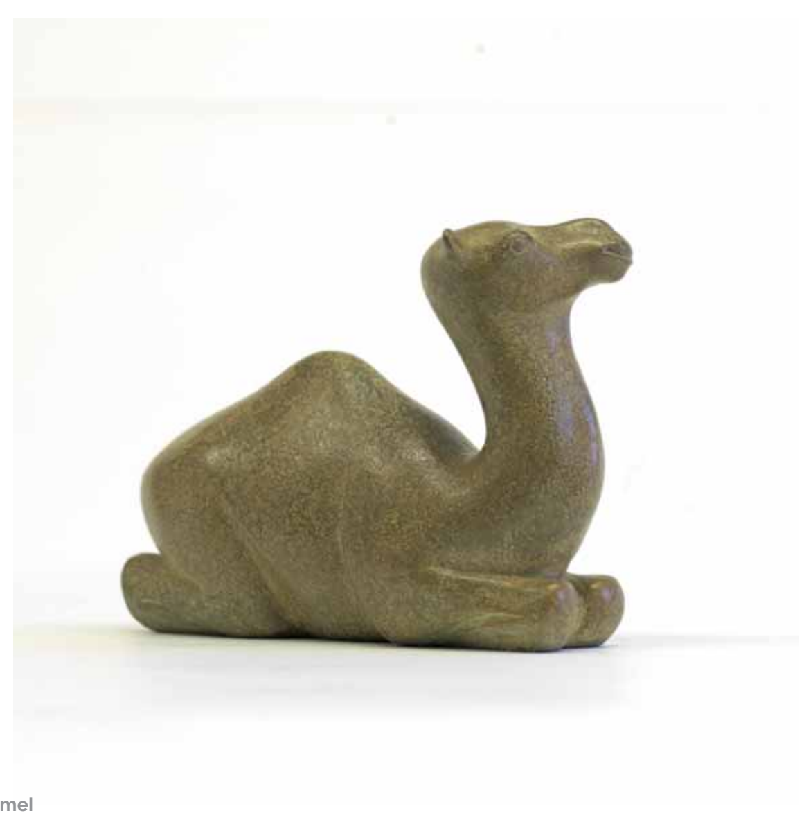
Small Camel Bronze Edition of 12 12cm high