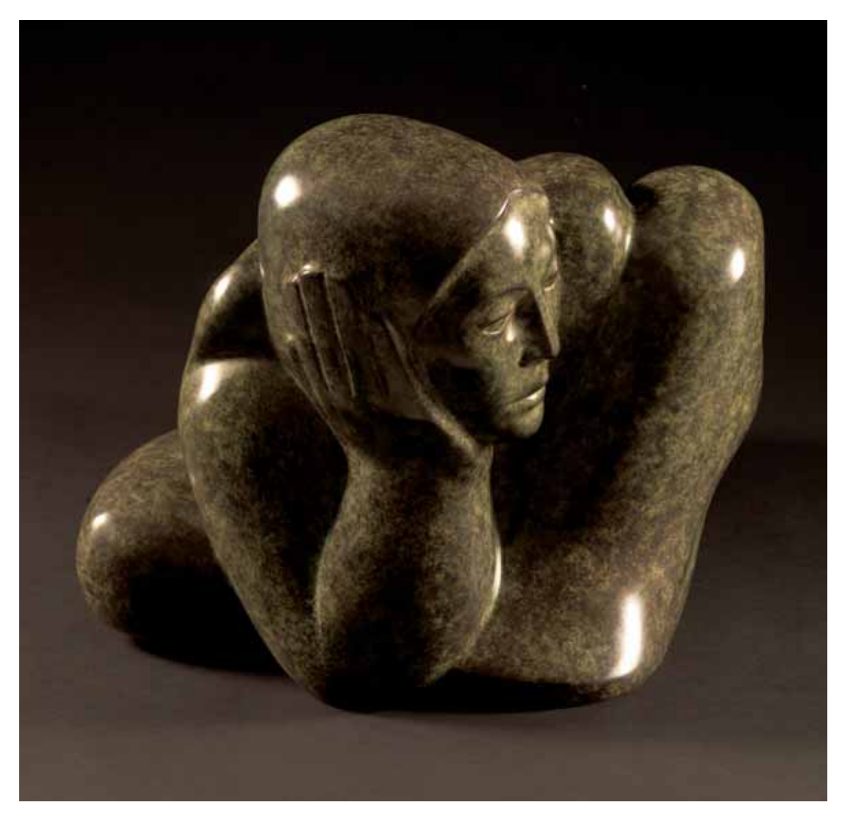
Girl Curled Bronze Edition of 9 33cm high