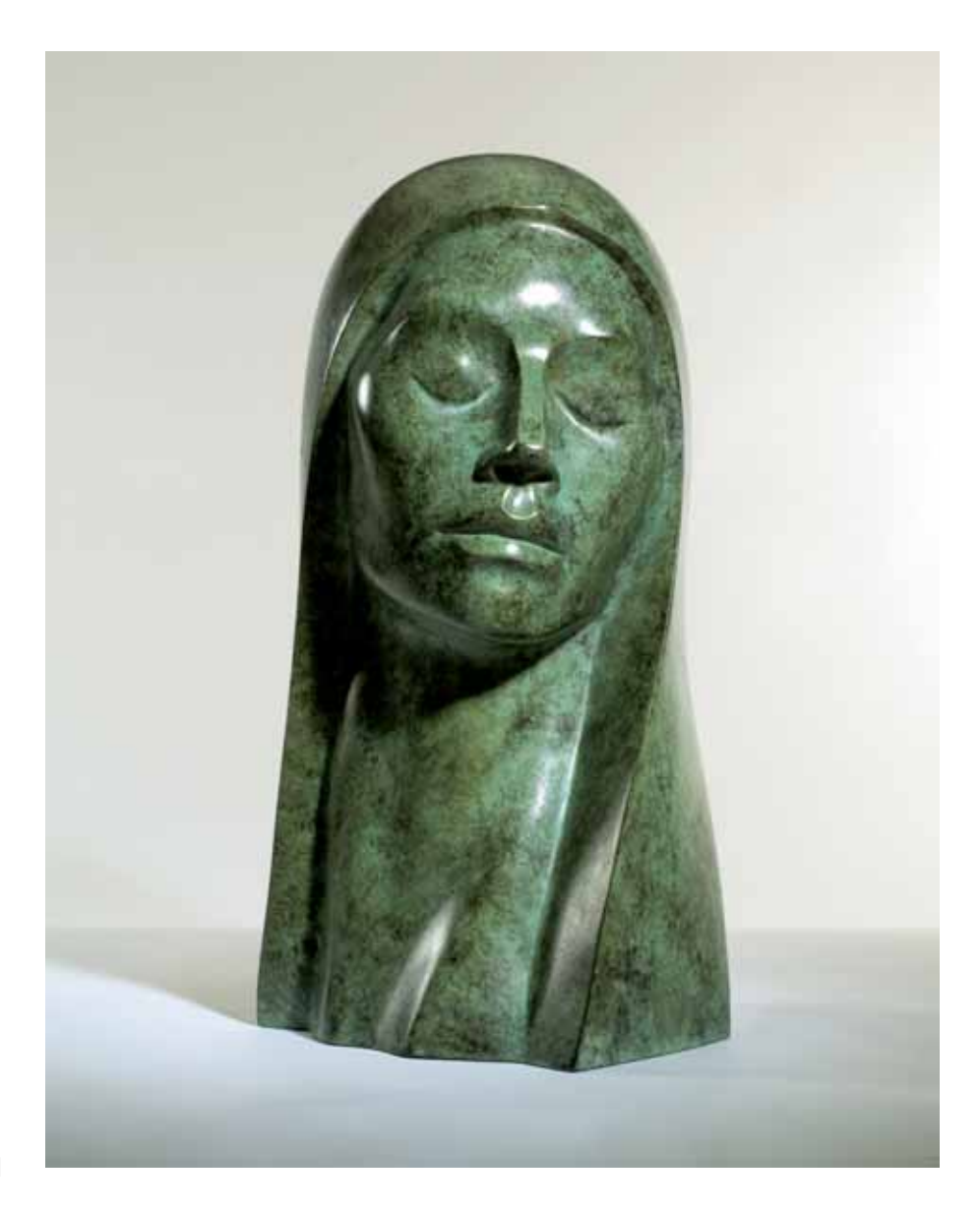
Madonna Head Bronze Edition of 9 50cm high