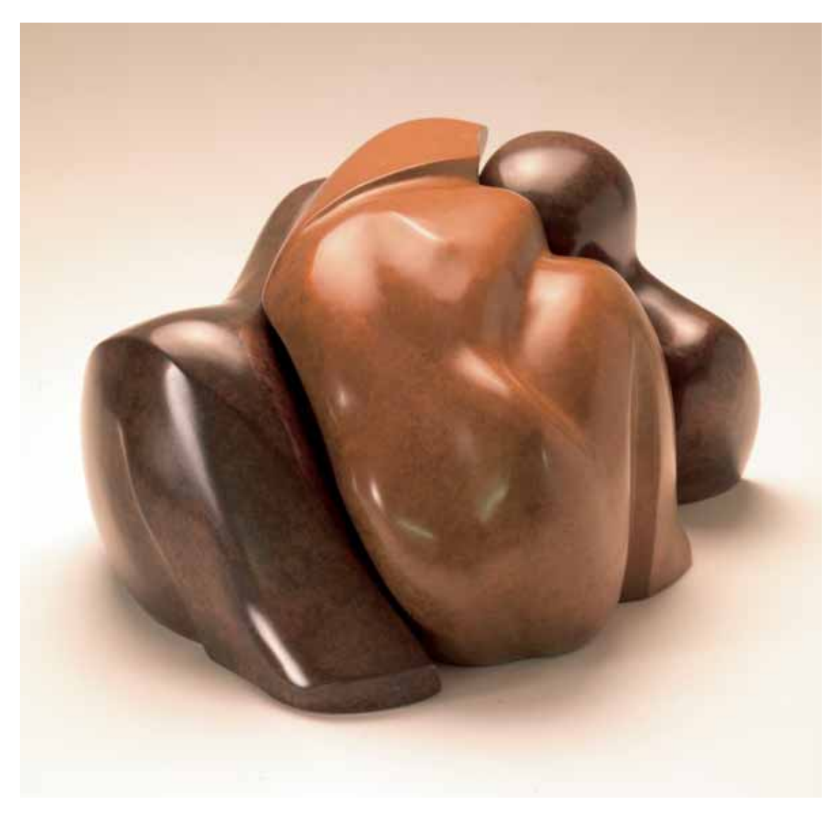
Linked Figures small Bronze Edition of 9 14cm high