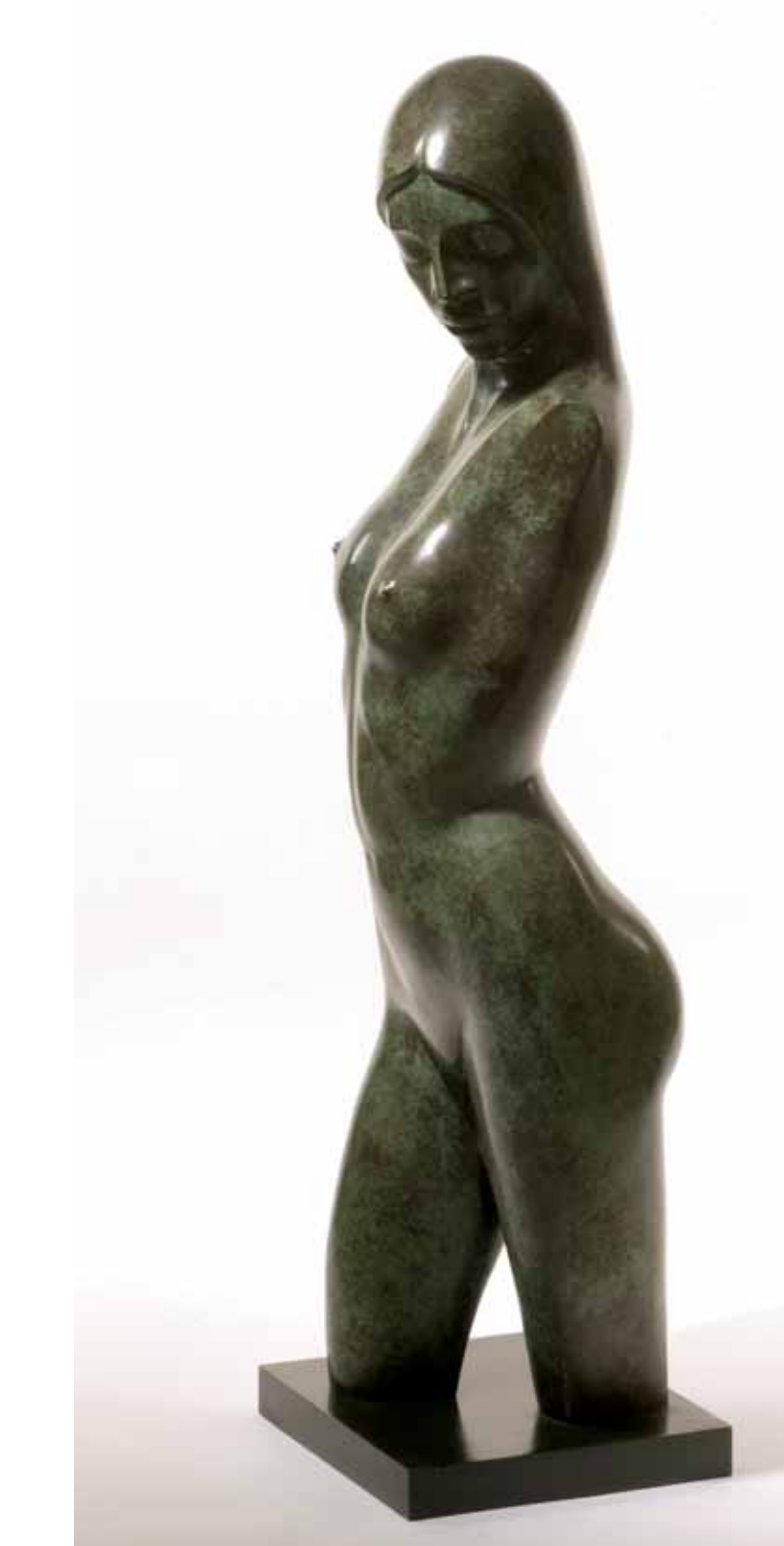
Standing Torso with head Bronze Edition of 9 109cm high