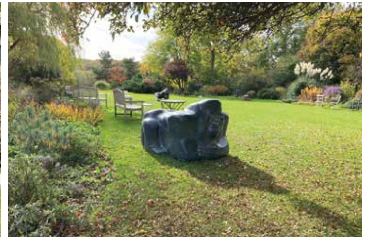
Reclining Gorilla Kilkenny Limestone Unique 96 x 112 x 155 cm