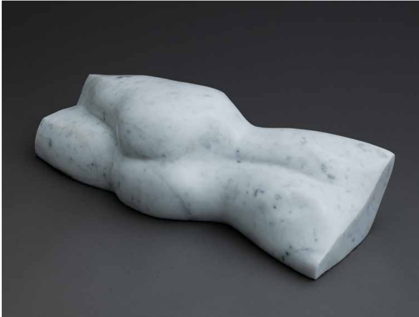
Torso Marble Unique 12 x 40 x 16 cm