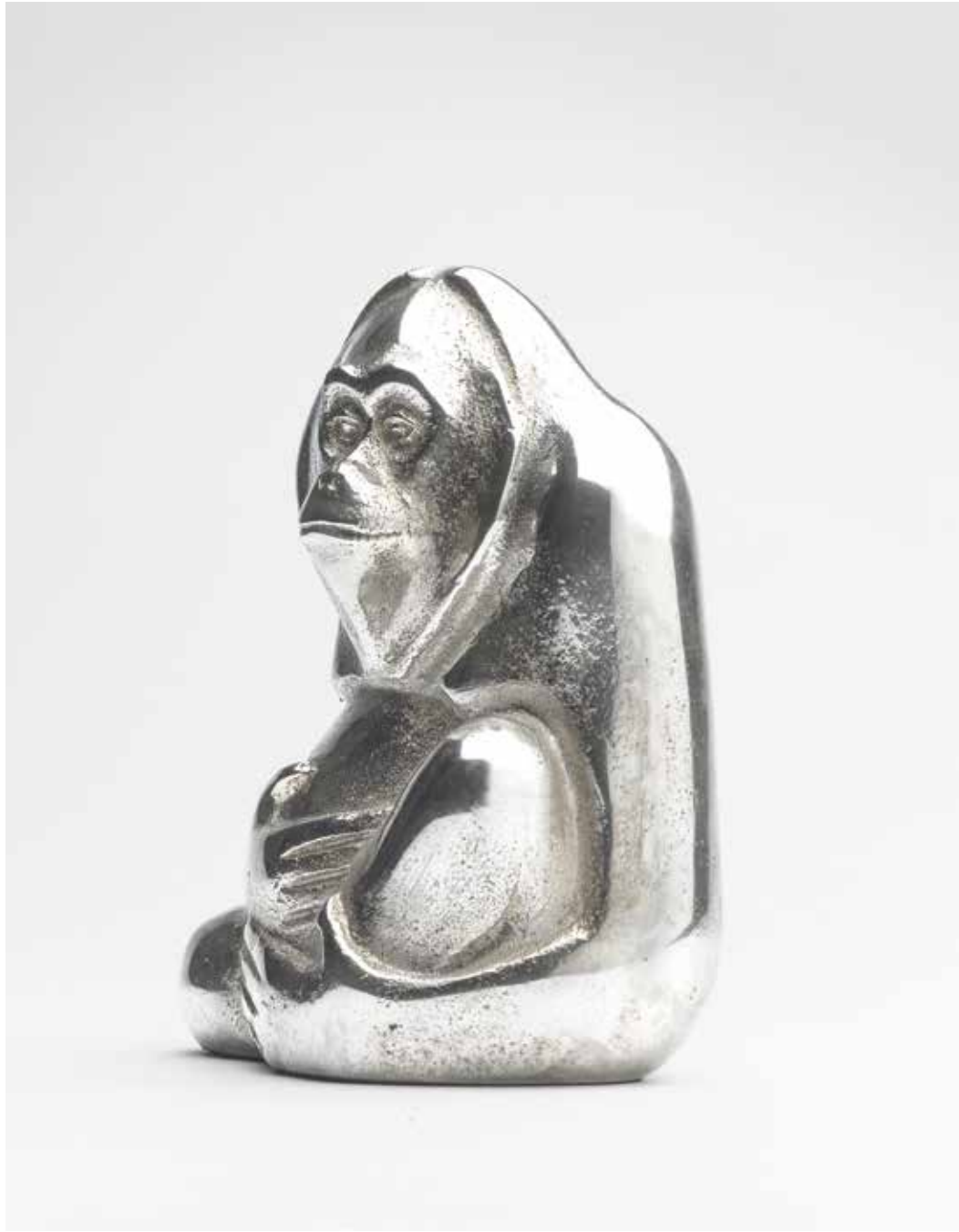
Small Orangutan Sterling Silver Edition of 9 12 x 10 x 6.5 cm