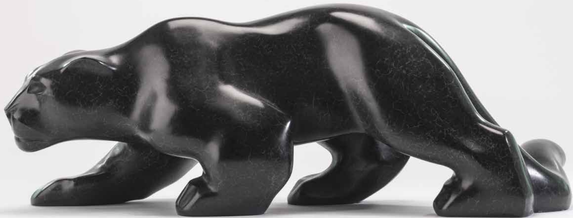
Stalking Jaguar Bronze Edition of 9 26.5 x 34 x 72.5 cm