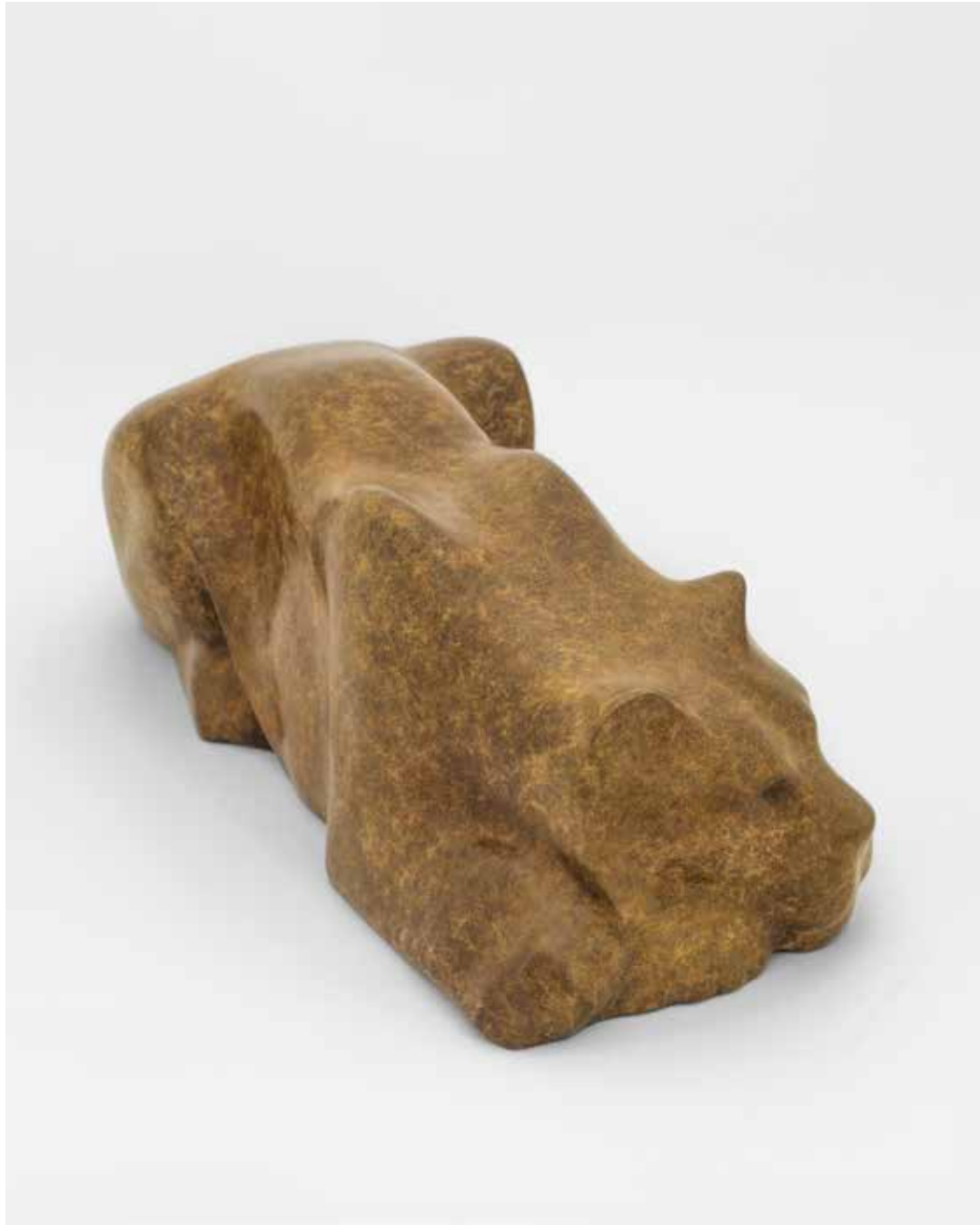
Siberian Tiger Bronze Edition of 9 16 x 50 x 18 cm