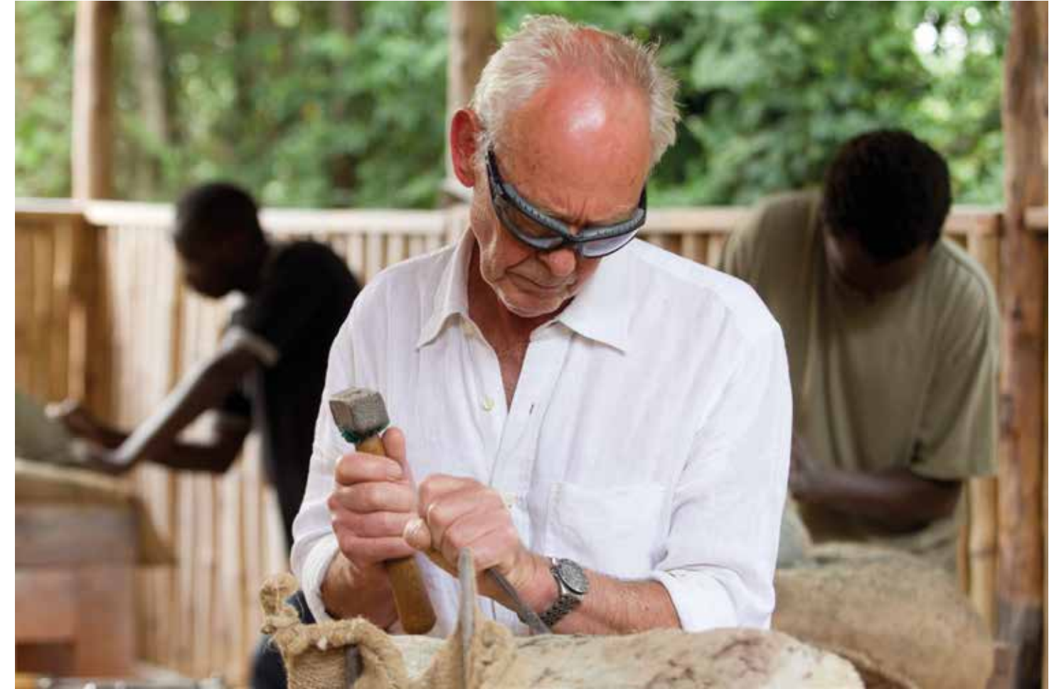
Stone carving workshop 2011 Rwenzori Founders Uganda