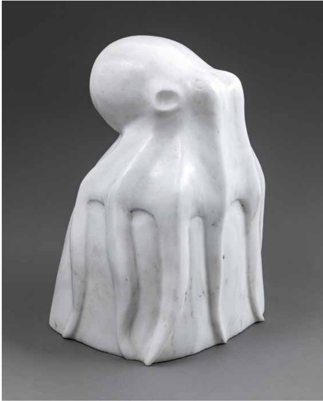
Octopus Marble Unique 32 x 22 x 18 cm