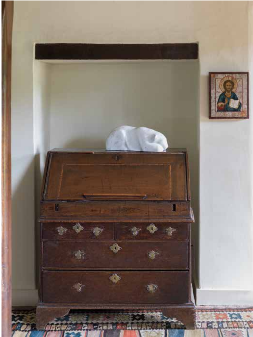
Reclining Polar Bear Marble Unique 16 x 40 x 13 cm