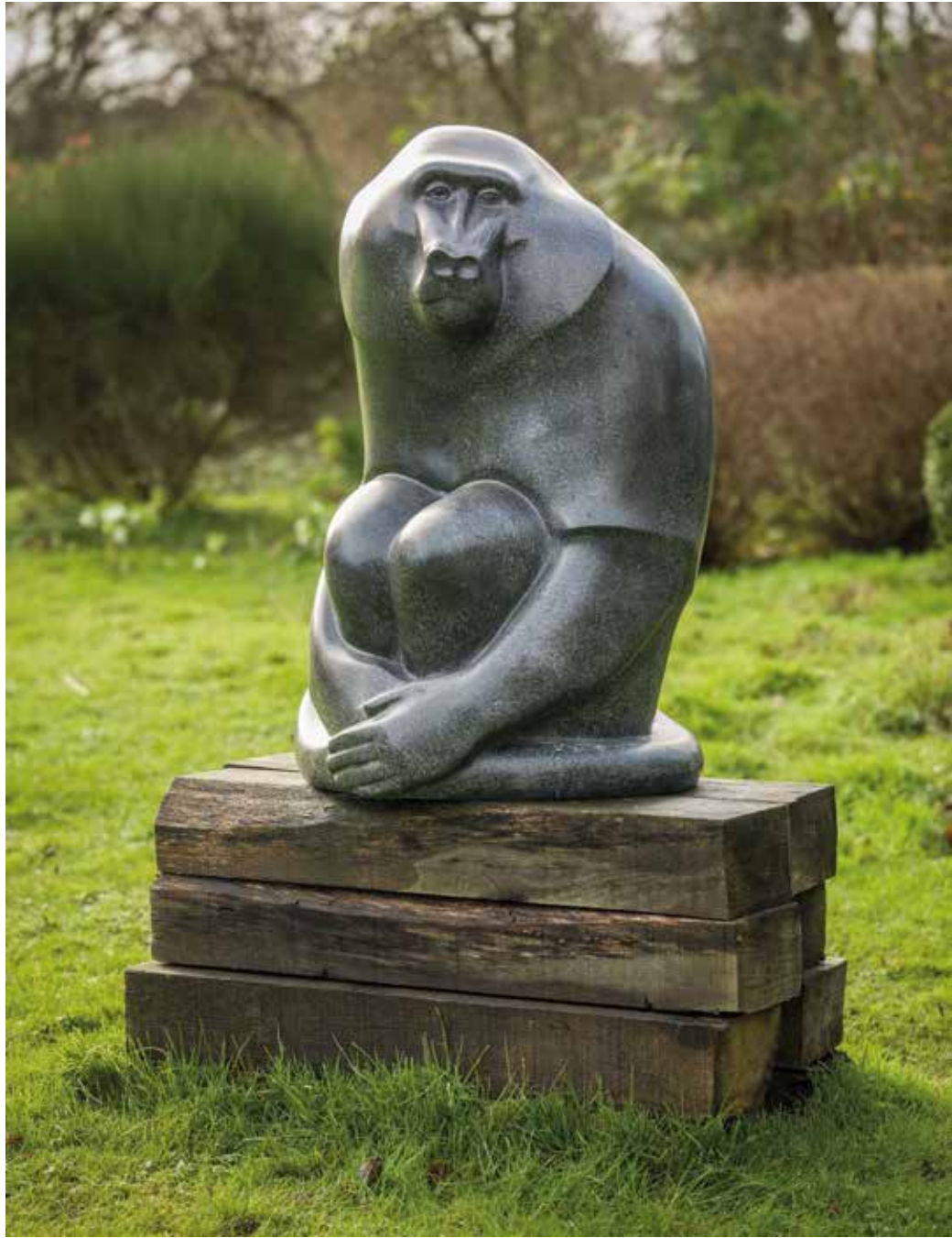
Baboon Bronze Edition of 9 88 x 48 x 54 cm