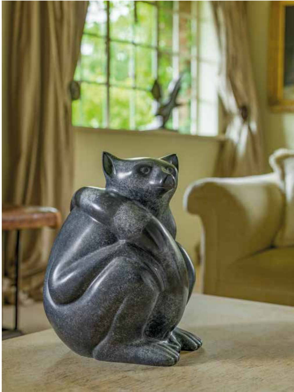
Lemur Bronze Edition of 9 37 x 30 x 30 cm