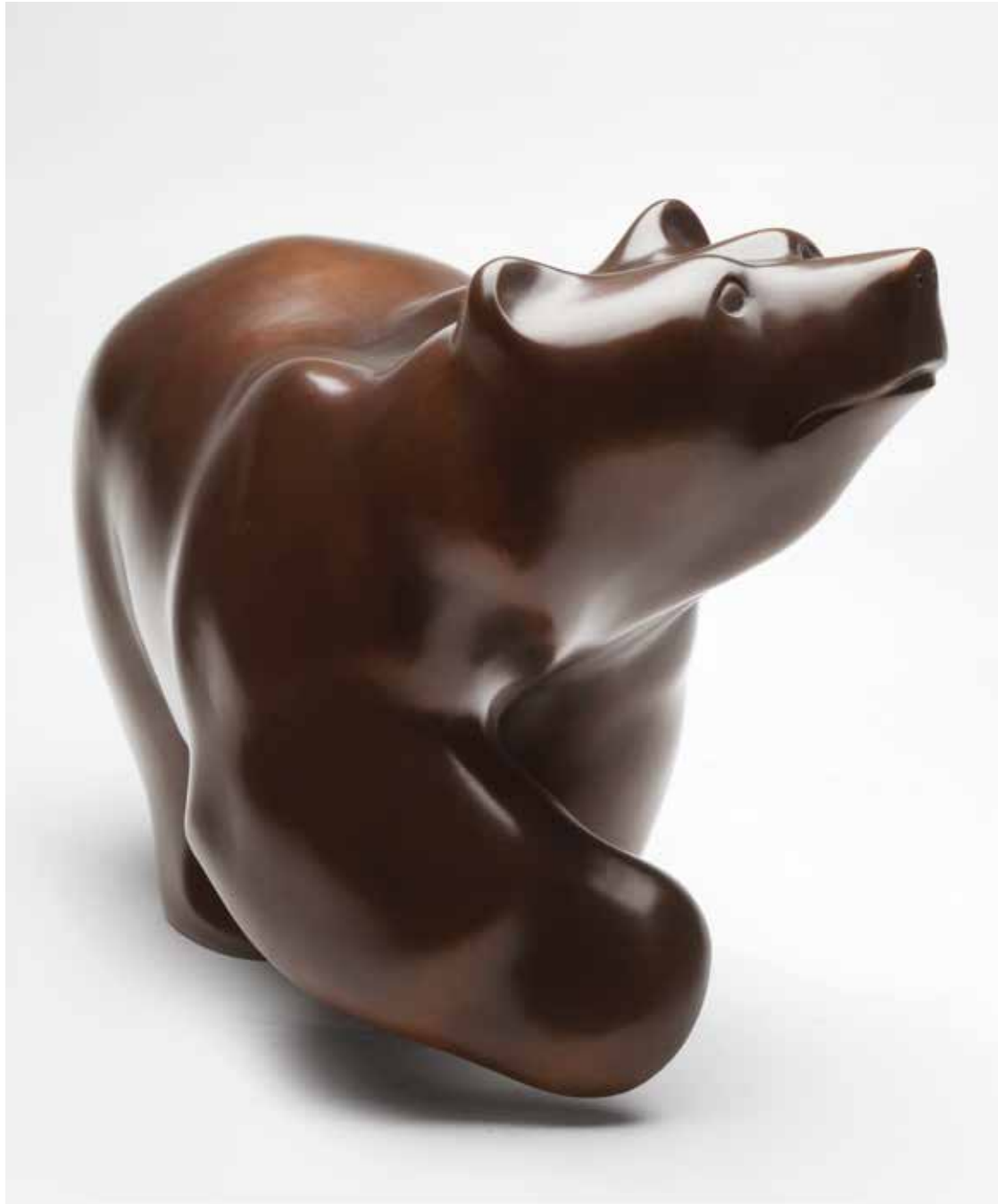
Brown Bear Bronze Edition of 9 34 x 25.5 x 53 cm