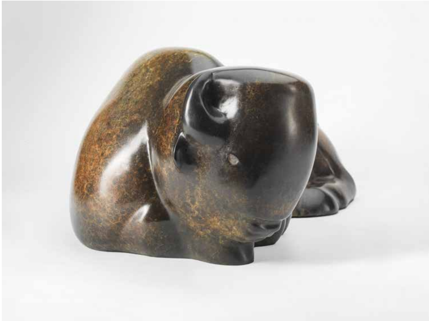
Bison Bronze Edition of 9 21 x 31 x 55 cm