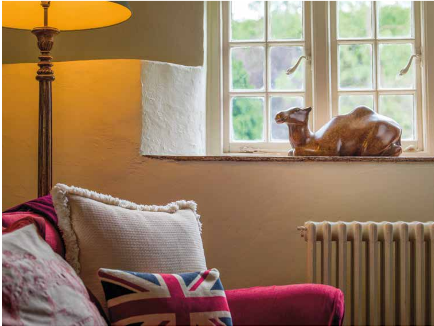
Camel III Bronze Edition of 9 23 x 19 x 49 cm