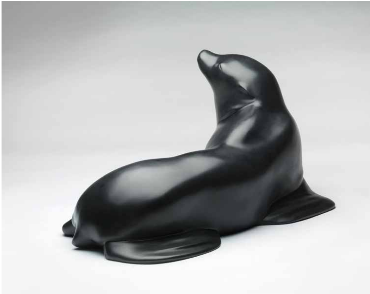
Sea Lion Bronze Edition of 9 35 x 33 x 73 cm