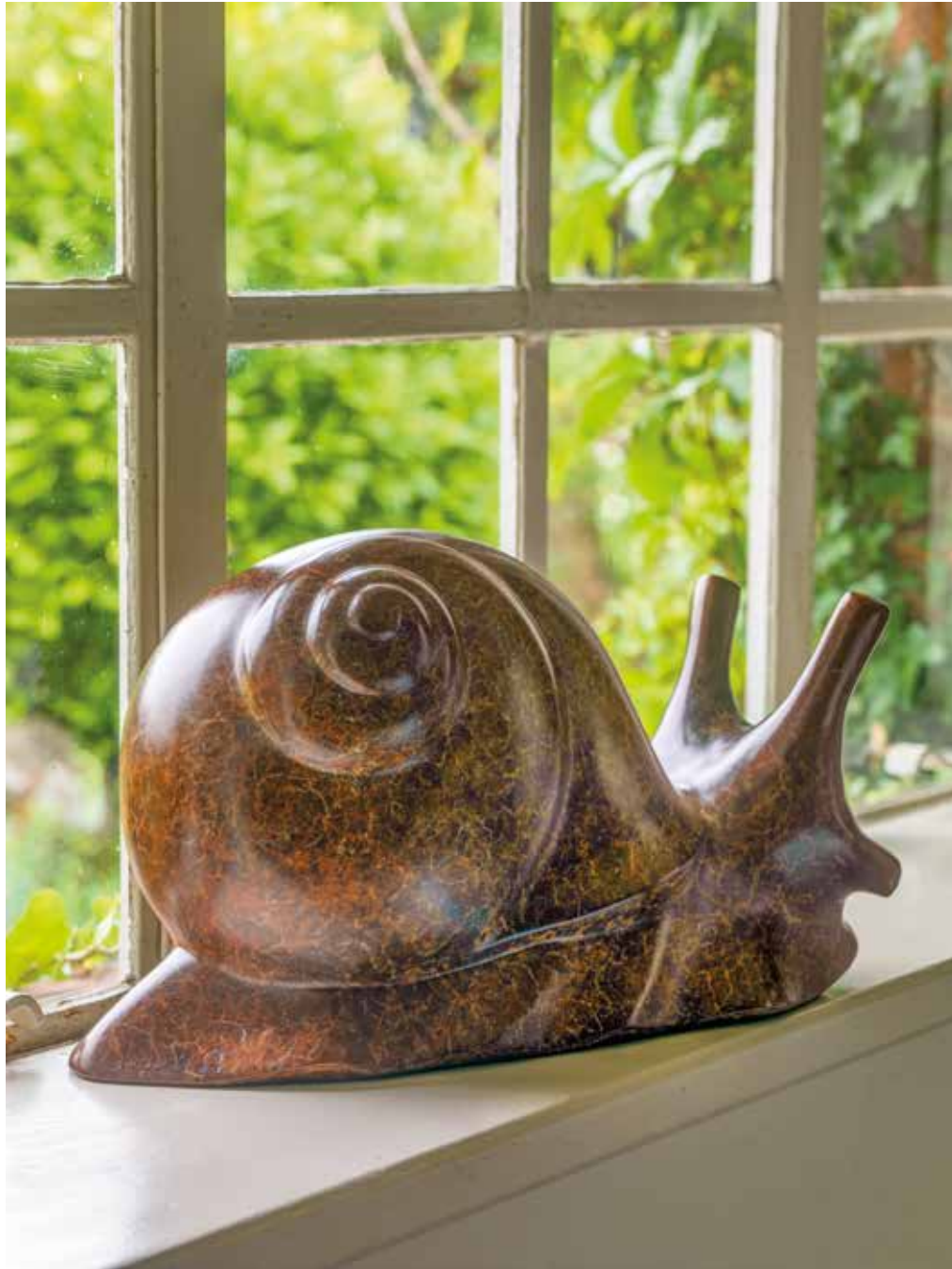
Snail Bronze Edition of 9 20 x 34 x 16 cm