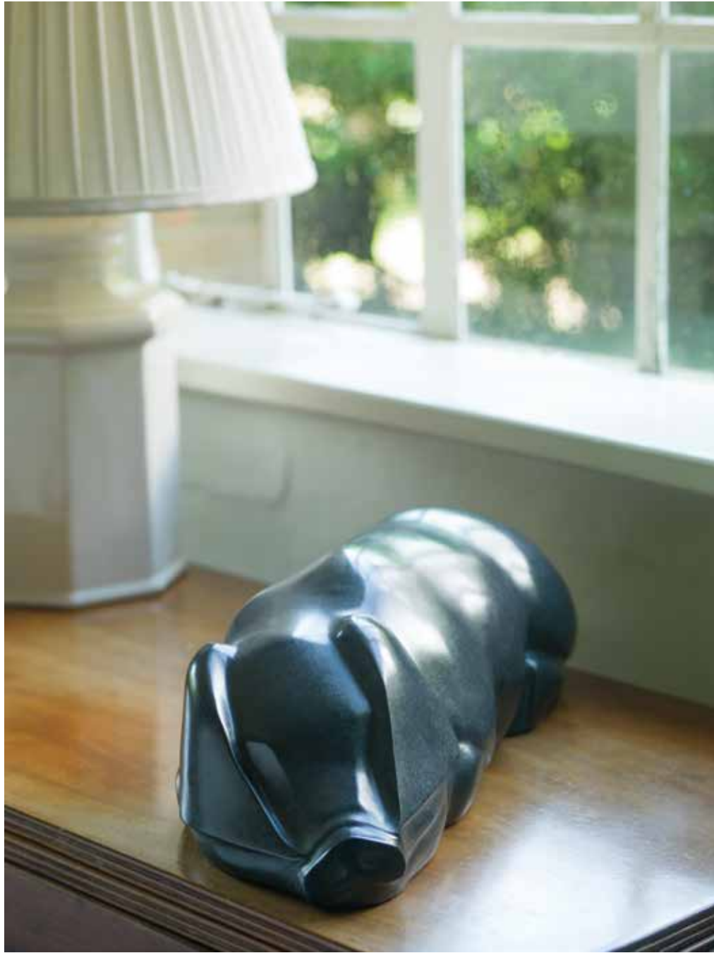
Pig Bronze Edition of 9 15 x 50 x 17 cm