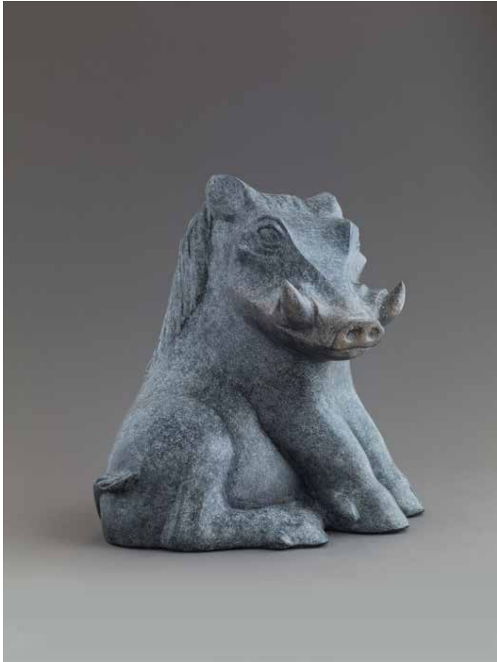
Warthog Seated Bronze Edition of 9 39 x 29 x 33 cm