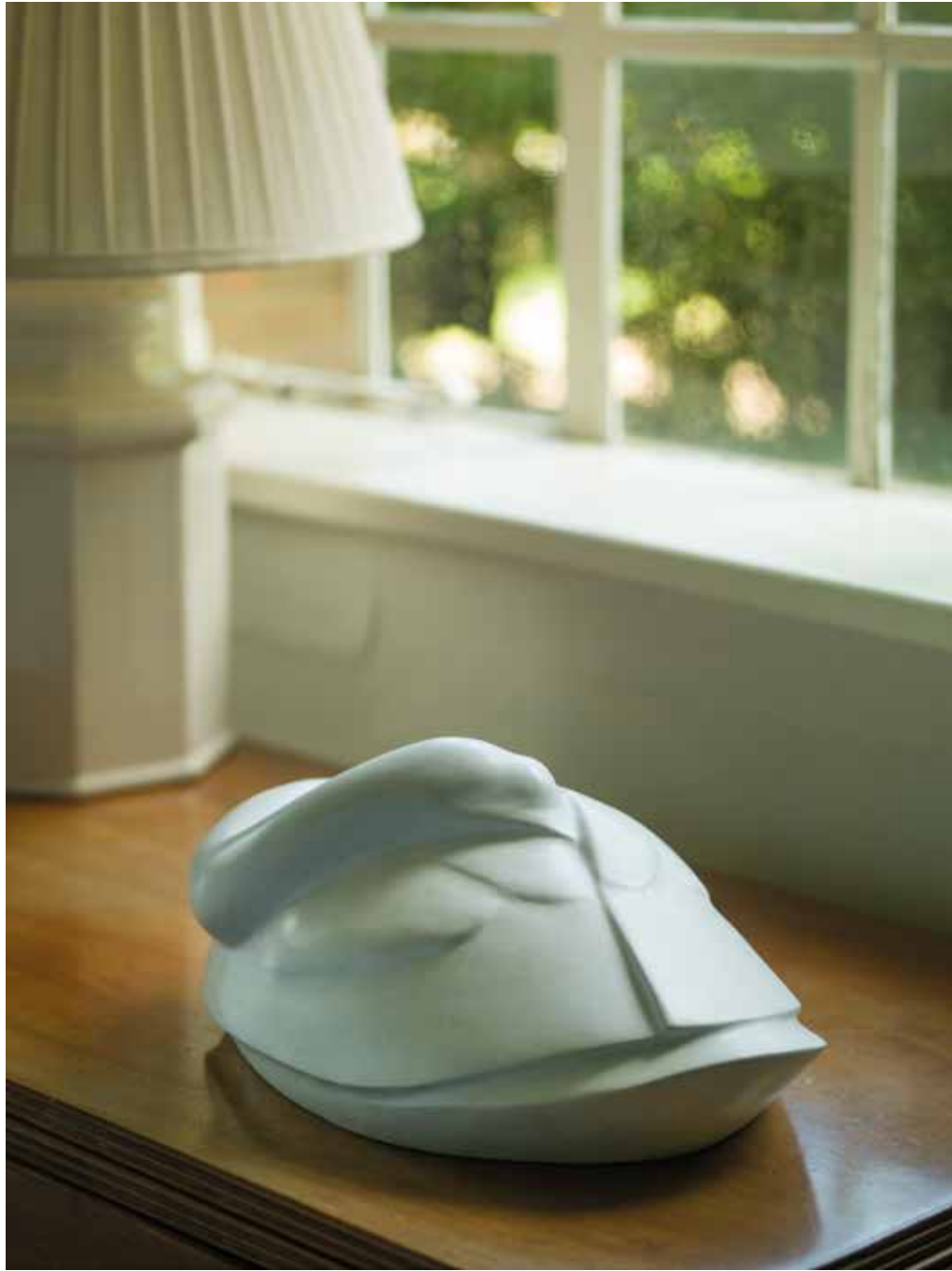
Swan Bronze Edition of 9 15 x 34 x 23 cm