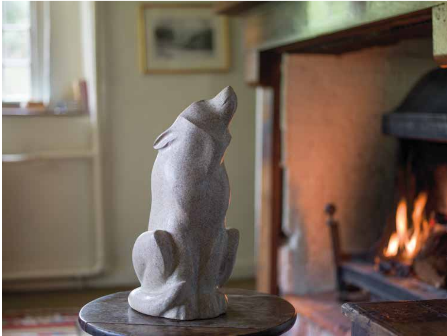
Wolf Stone Unique 45 x 20 x 20 cm