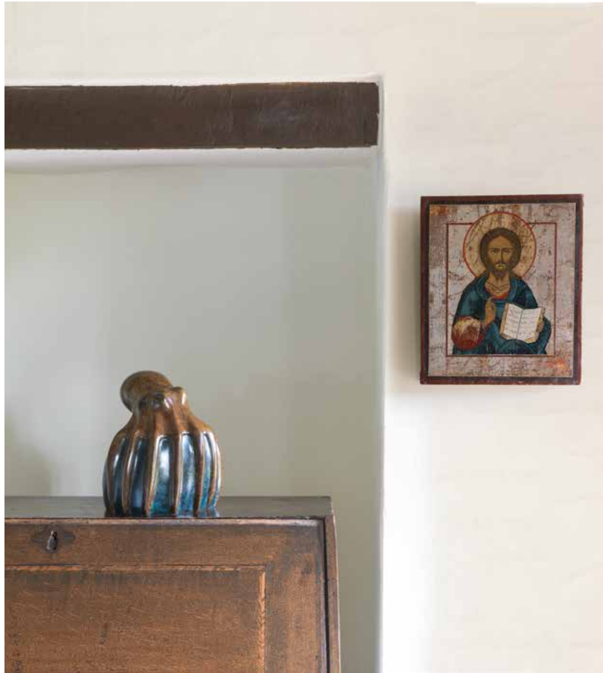
Octopus Bronze Edition of 9 22 x 18 x 17 cm