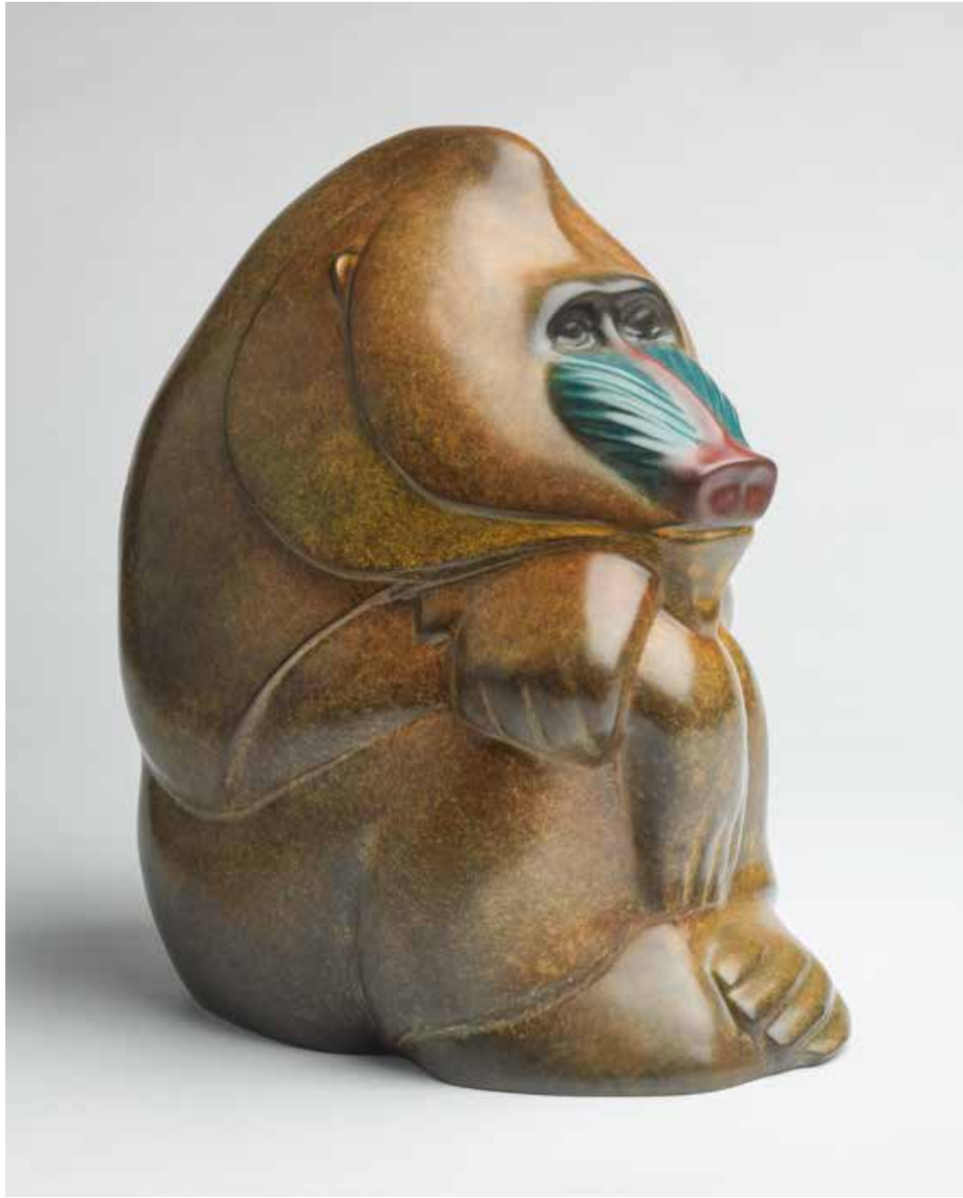
Mandrill Bronze Edition of 9 38 x 32 x 24 cm