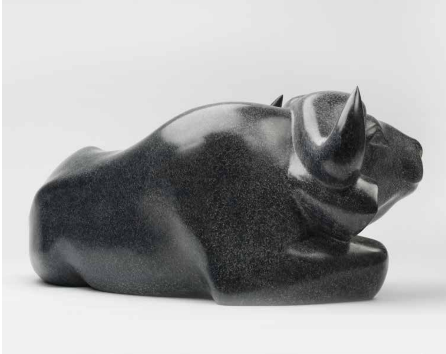
Cape Buffalo Bronze Edition of 9 28 x 62 x 38 cm