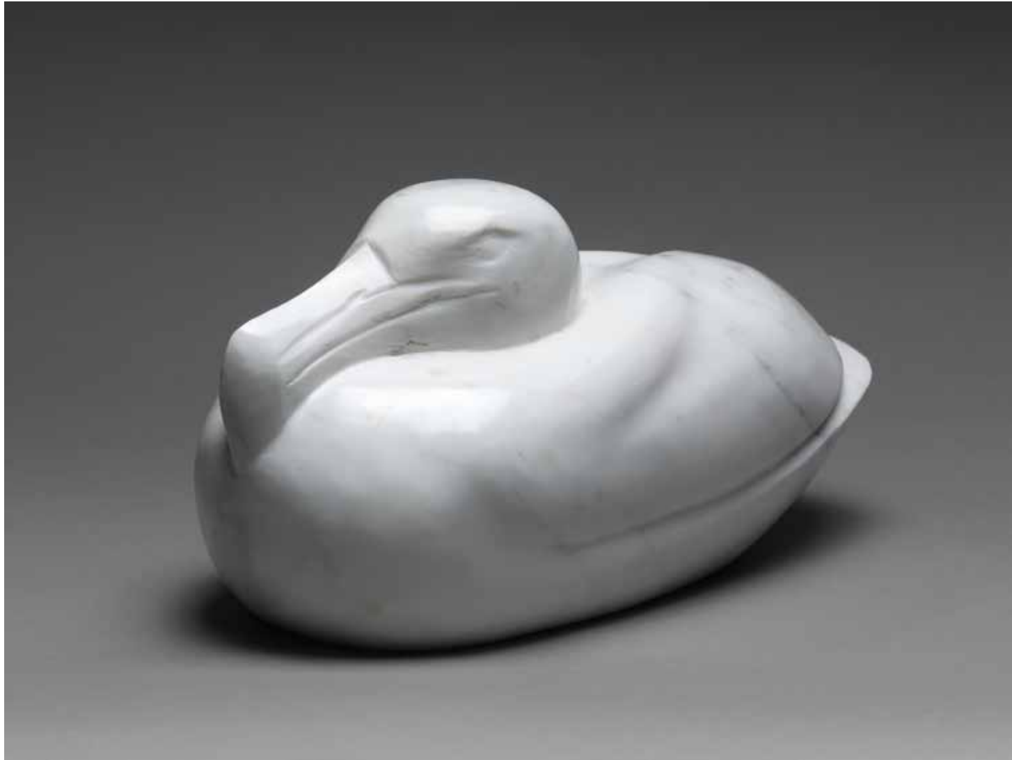
Albatross Marble Unique 20 x 41 x 17 cm