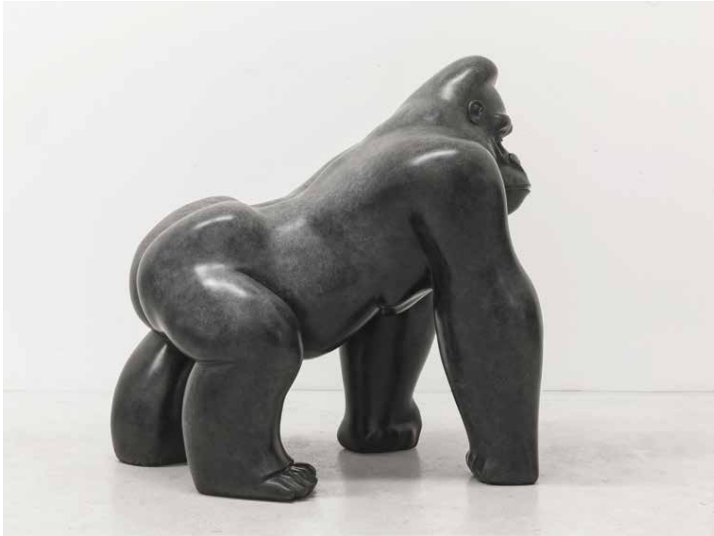
Gorilla (Large) Bronze Edition of 6 94 x 95 x 74 cm