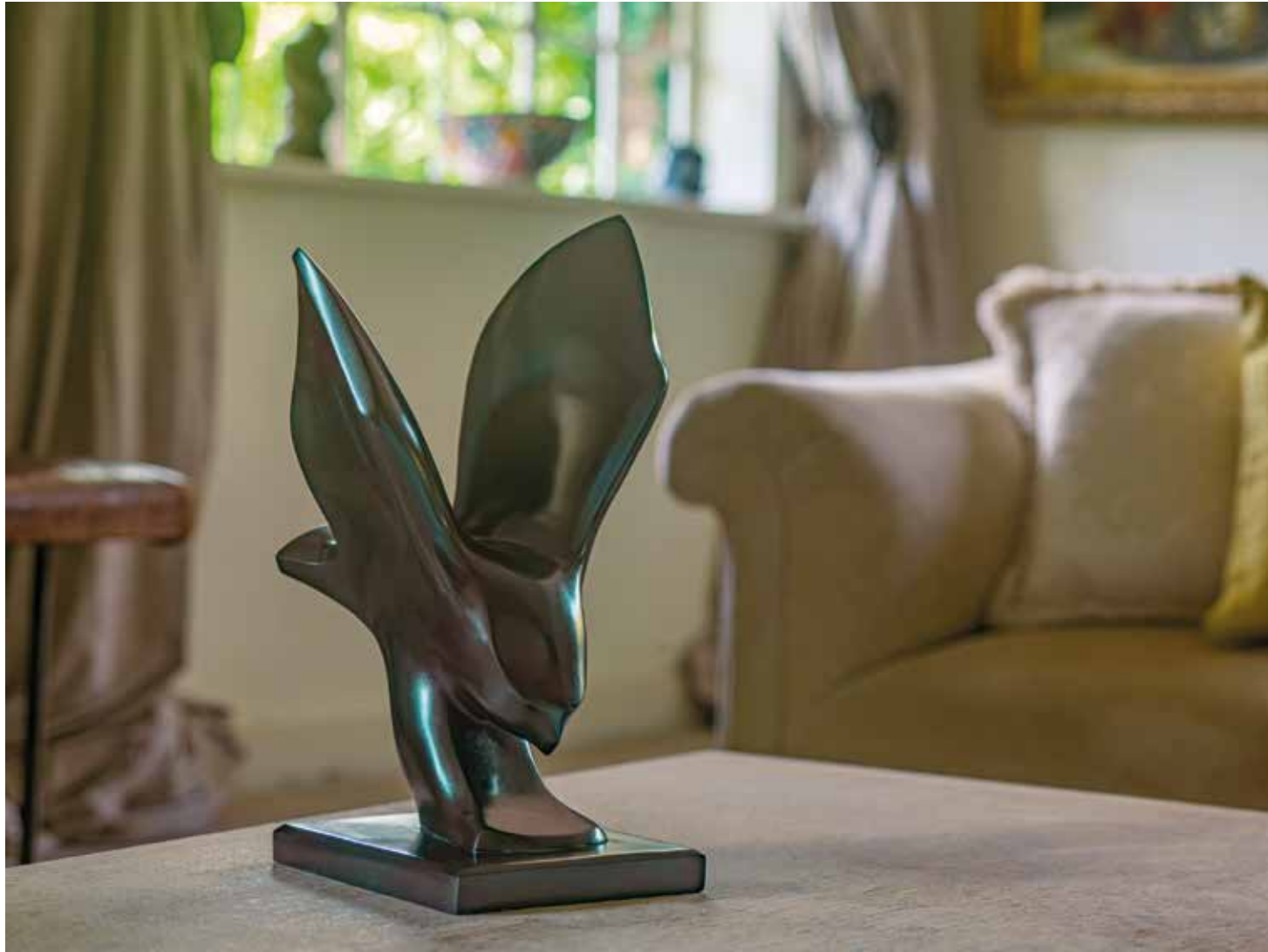
Falcon Bronze Edition of 9 40 x 30 x 25 cm