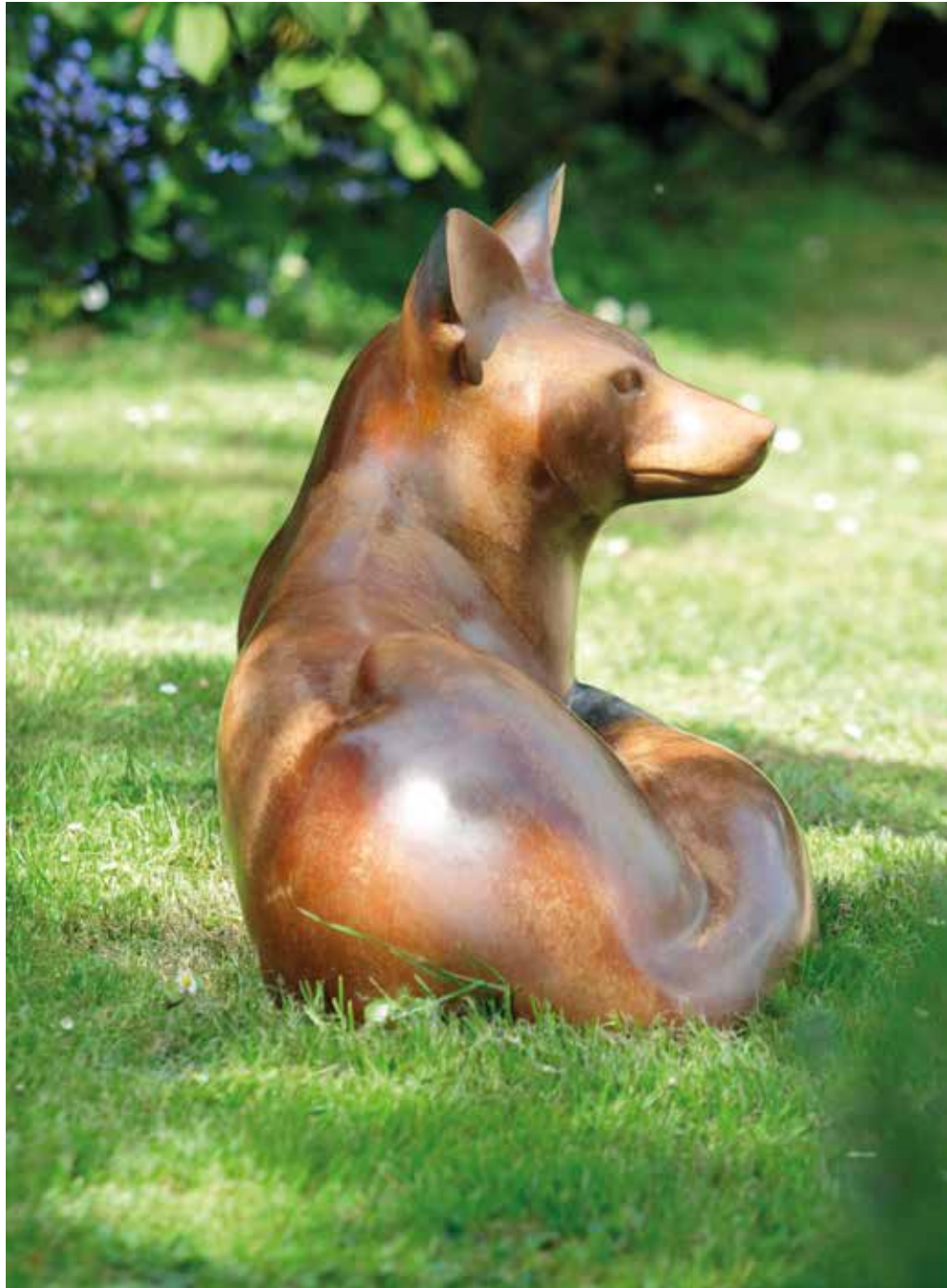
Fox Bronze Edition of 9 50 x 68 x 41 cm