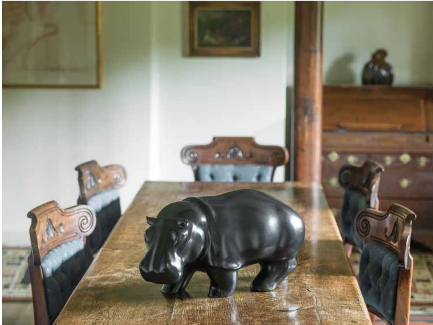
Hippo Standing Bronze Edition of 9 27 x 22 x 49 cm