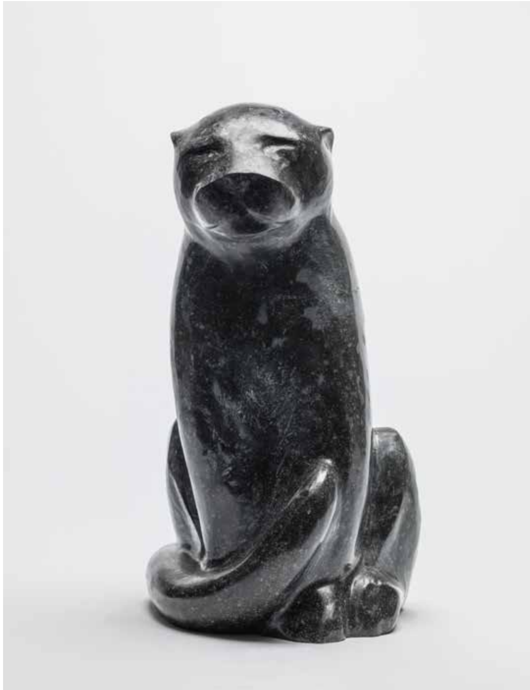
Seated Leopard Kilkenny Limestone Unique 37 x 25 x 20 cm