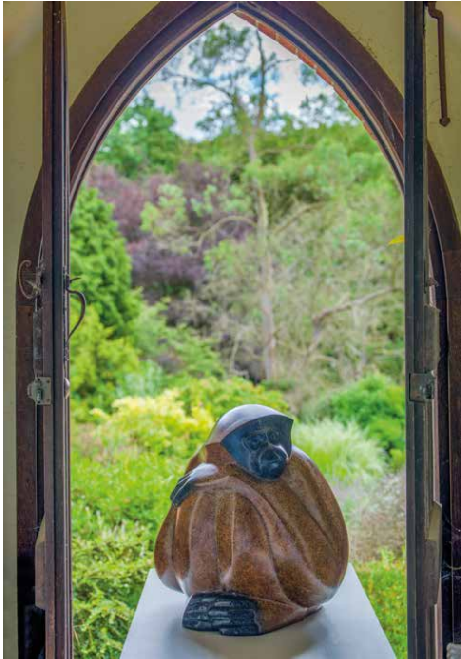
Lar Gibbon Bronze Edition of 9 53 x 49 x 39 cm