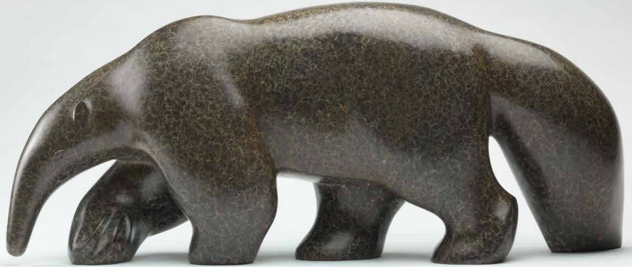
Anteater Bronze Edition of 7 24 x 68 x 17cm