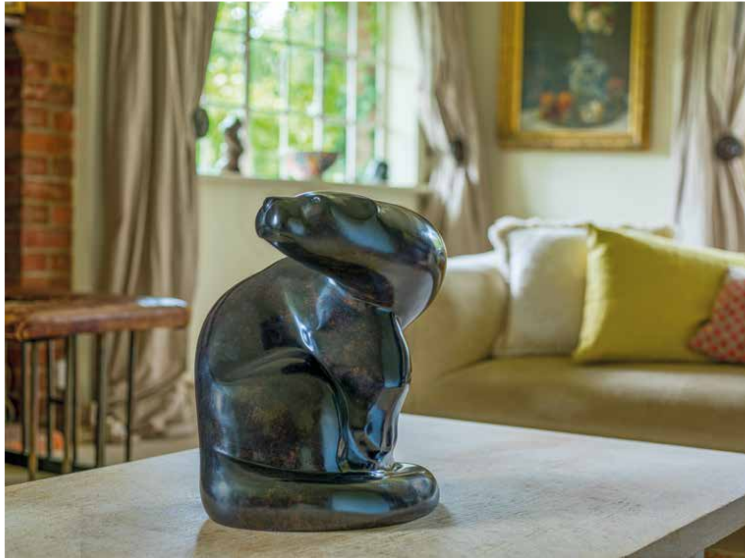
Seated Otter Bronze Edition of 9 45 x 37 x 40 cm