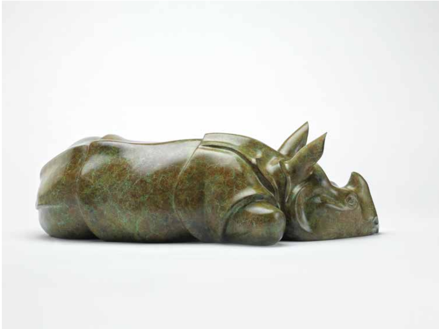
Asian Rhino Bronze Edition of 9 22 x 37.5 x 66 cm