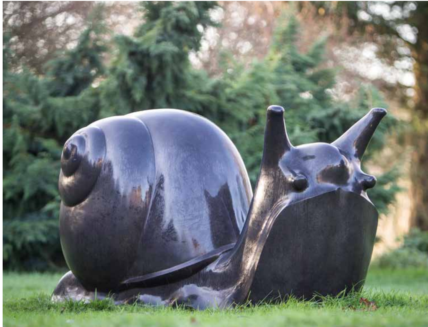
Snail (Monumental) Bronze Edition of 6 92 x 160 x 155 cm