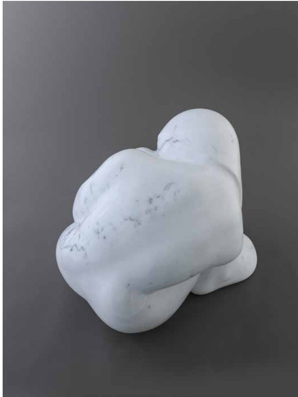
Mother and Child Marble Unique 32 x 26 x 36 cm