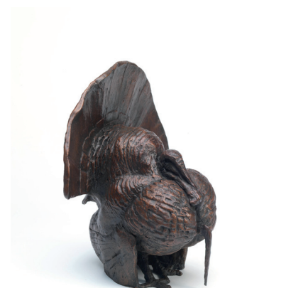
Fantail Turkey