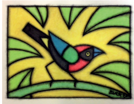
Hot Bird Jon Buck