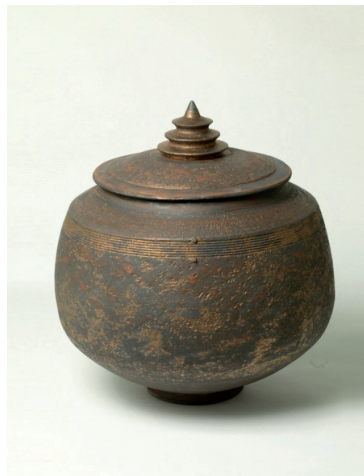
Templetop Vessel Jason Wason