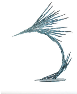
Storm Bird 2013