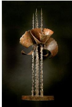
The Thornflower 2006