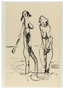
Two Girls Bathing c.1955 Ink