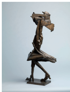
Striding Woman with Child 1959 Bronze