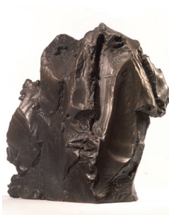
Head 1960 Bronze