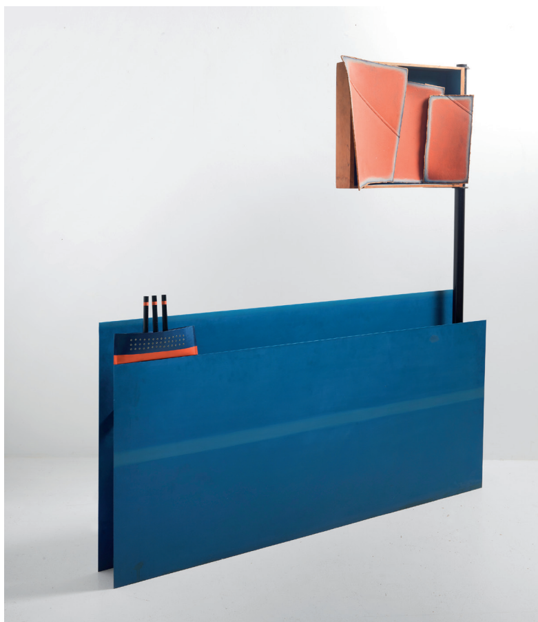
Near and Far 1968 Painted Steel

■ Gallery Pangolin is proud to represent the Fullard Estate and this major retrospective is the first solo exhibition of his work since 1998. The show brings together bronzes, assemblages and drawings from all periods of Fullard's oeuvre, including many previously unseen pieces.