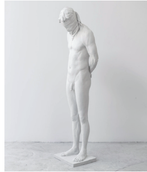
Untitled Marcos Perez