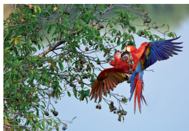
Macaws