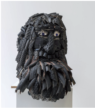
Re 'Cycle'd Tyred Head Buffy