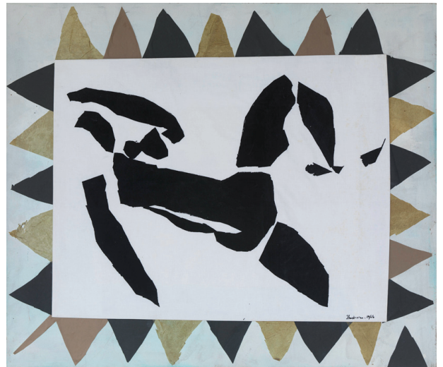
Reclining Figure 1966