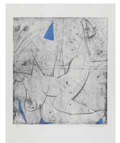
Miracolo Marino Marini