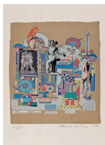
Untitled 1990 Eduardo Paolozzi